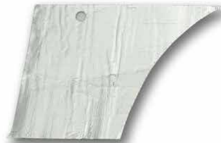
Inner Quarter Panels