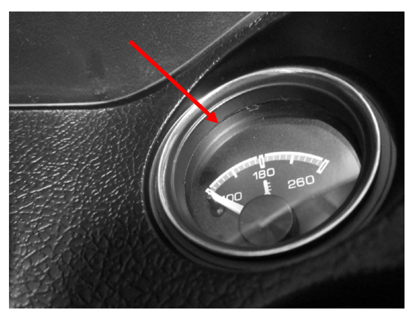
5b. The HDX system should align tightly and the lens should sit flush with the bezel.

5a. Align the bezel over the gauges. Watch carefully so you don't scratch or damage the lens.