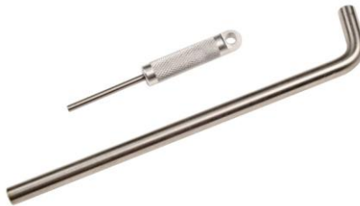
Figure 2 - Spanner Wrench & Adjustment Tool

NOTE: Detroit Speed does include a Spanner Tool (P/N: 031060) to adjust ride height however if you have the adjustable coilover shocks, Detroit Speed does offer an Adjustment Tool available as P/N: 031061 if needed. A photo can be seen in Figure 2.