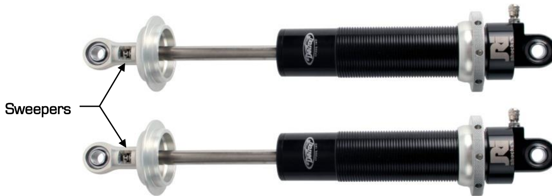
Figure 5 - Detroit Speed Double Adjustable Shock

To change from the recommended “Detroit Tuned” valving, adjustments can be made independently to both the high and low speed settings. The rebound is controlled by the sweepers at the lower shock mount. The sweepers rotate clockwise (+) to increase the damping and counterclockwise (-) to decrease the damping. The sweepers can be seen in Figure 5.