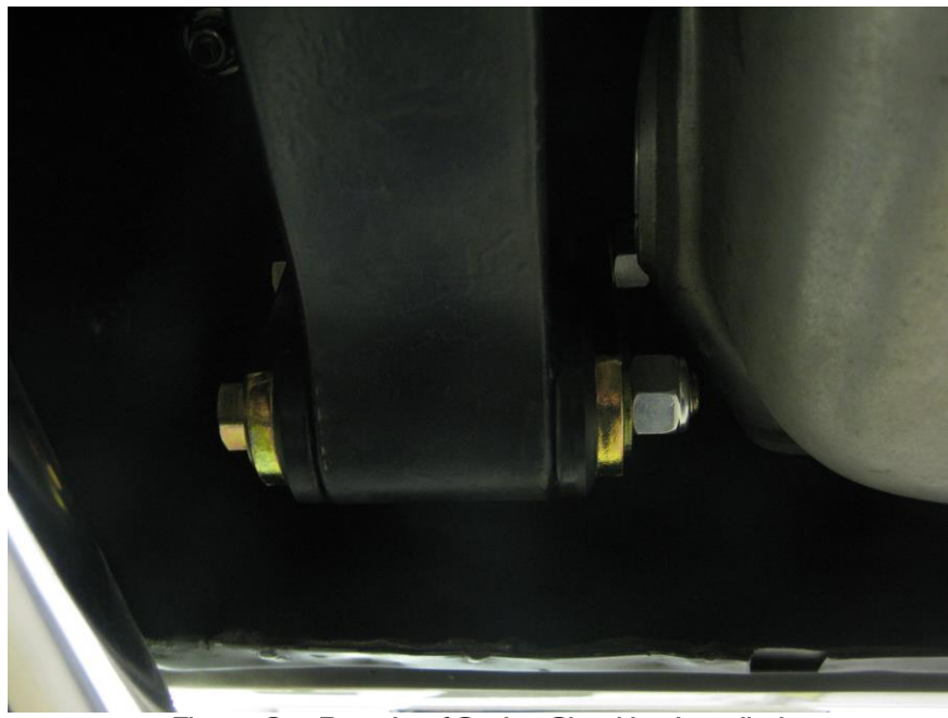
Figure 2 – Rear Leaf Spring Shackles Installed

5. Once the leaf springs are installed torque all fasteners to the information provided in the Torque Specification table listed at the top of page 2.