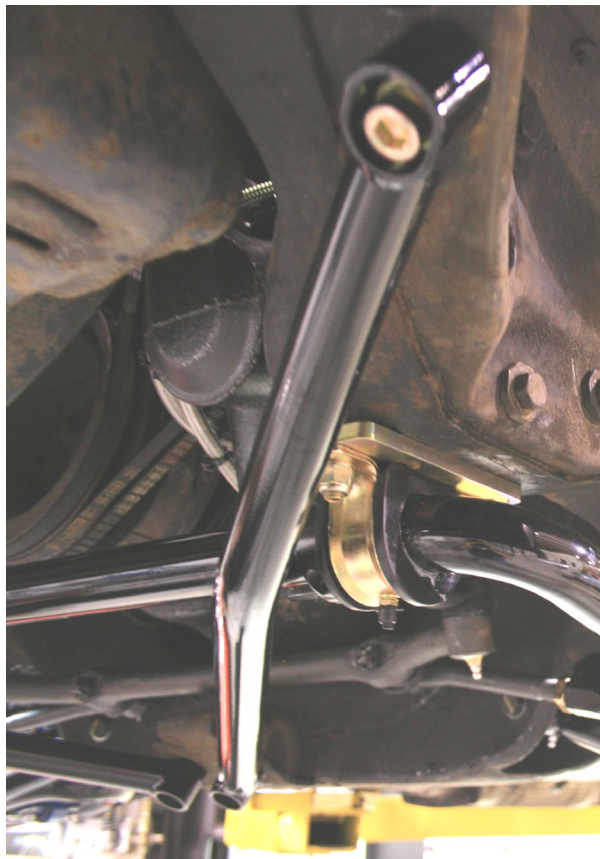
Figure 5 - Completed Installation

If you have any questions, please call Detroit Speed, Inc. at (704) 662-3272.