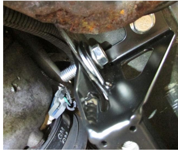
Figure 2 - Install M10 Washers