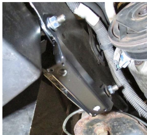
Figure 3 - Install M10 Locknuts