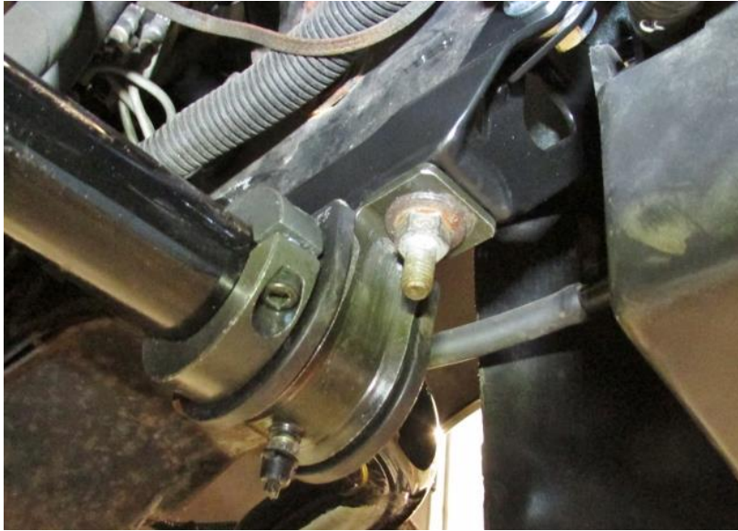
Figure 4 - Install Sway Bar to HD Brackets