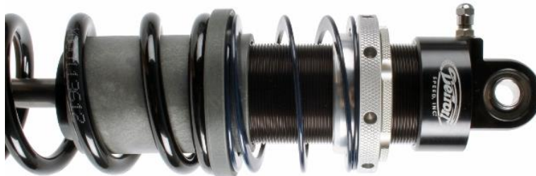
Figure 3 - Re-assemble Coilover Shock/Spring