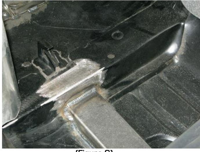
(Figure 6) Page 3 of 5

10. When using an aftermarket one-piece floor pan the braces in front of the rear seat riser needs to be cut out to gain welding access for the rear of the connector. Once it is welded in place, notch the brace so that it can be welded in place over the connector (Figure 6)