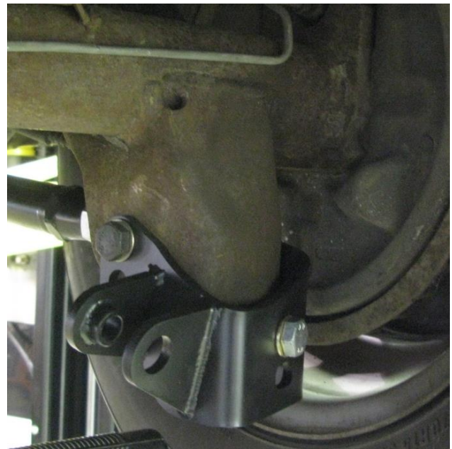
Figure 1 - Installed Lower Coilover Bracket