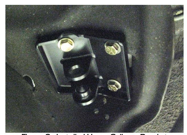
Figure 2 - Installed Upper Coilover Bracket

6. Install the upper coilover shock mount. In the larger, outboard holes, use the included 7/16" SAE flat washers in addition to the included 3/8" SAE flat washers with the 3/8"-24 x 1" hex head bolts and 3/8"-24 Nylock nuts. In the two remaining holes, insert two 3/8"-24 x 1" hex head bolts through the doubler plate and thread the provided 3/8" Nylock nuts onto the bolts along with the 3/8" AN washers. Torque all of the hardware at this time to 30 ft-lbs (Figure 2).