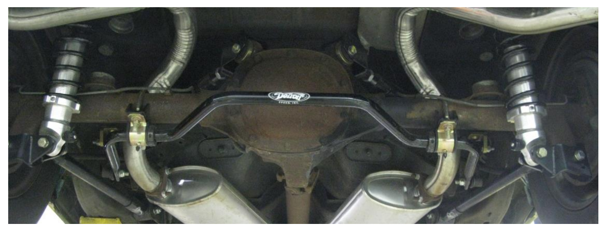
Figure 3 - Completed Coilover Installation

14.Once the vehicle is set on the ground, settle the suspension by jouncing both the front and rear by hand by pressing down on the body. Check the ride height at this point and adjust as necessary by turning the coilover adjusting nut. Detroit Speed does offer an Adjustable Spanner Wrench available as p/n: 031011. A picture of the spanner wrench can be seen in Figure 4 on the next page.