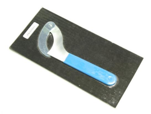
Figure 4 - Spanner Wrench