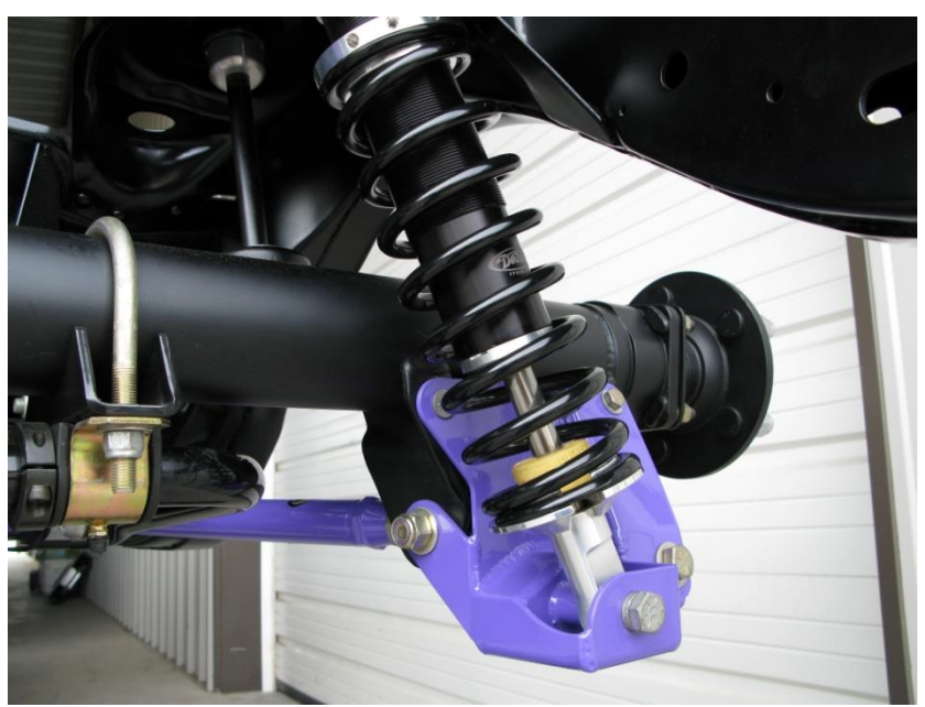
Figure 1 - Lower Coilover Bracket