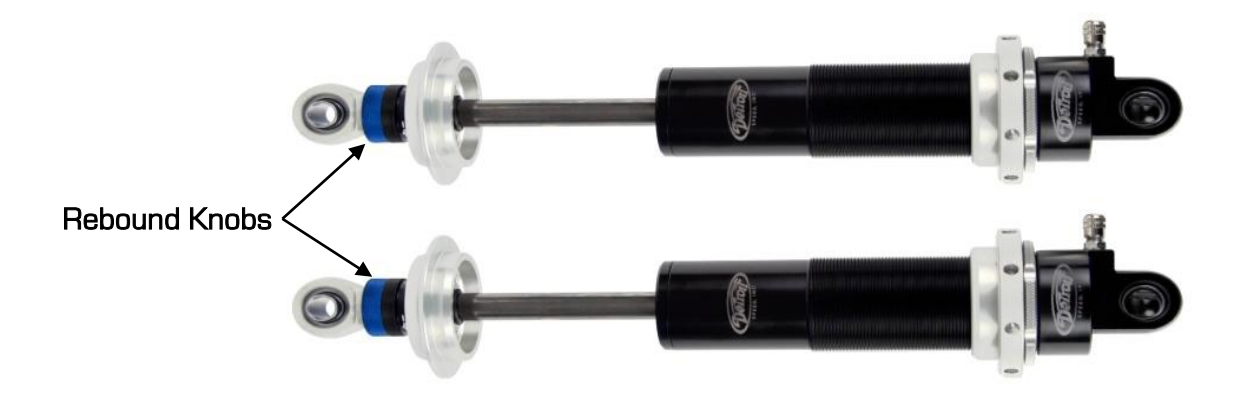
Figure 4- Detroit Speed Single Adjustable Shock

To change from the recommended "Detroit Tuned" valving, adjustments can be made independently to the rebound setting. The rebound is controlled by the knob at the lower shock mount (Shock is mounted body side up). The knob rotates clockwise (+) to increase the damping and counterclockwise (-) to decrease the damping. Refer to Figure 4