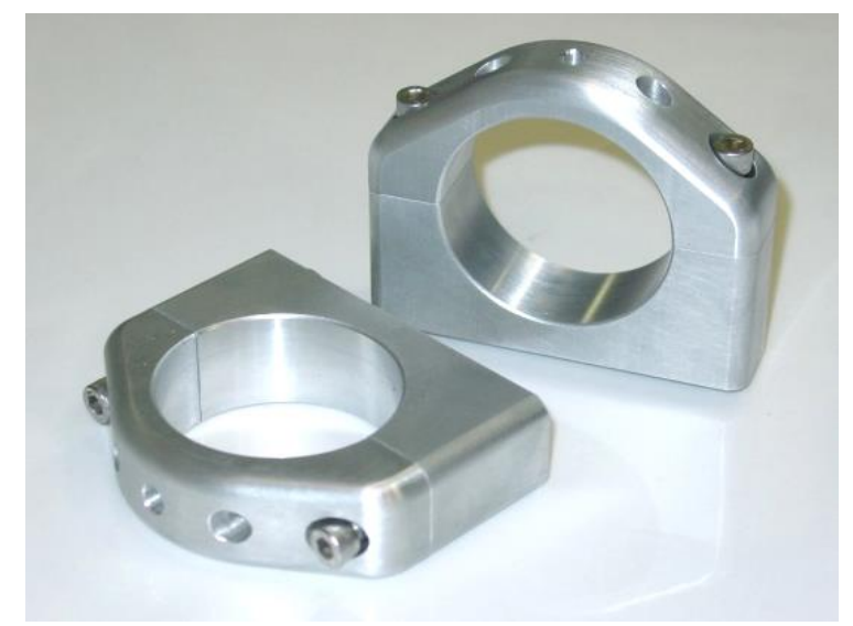
Figure 7 - Billet Aluminum Remote Canister Mounts

To aid in the installation of the reservoirs, we also offer a set of Billet Aluminum Remote Canister Mounts. The canister mounts are available exclusively through Detroit Speed, P/N: 032102. They are shown in Figure 7.