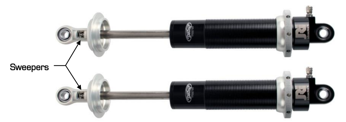
Figure 5 - Detroit Speed Double Adjustable Shock

To change from the recommended "Detroit Tuned" valving, adjustments can be made independently to both the high and low speed settings. The rebound is controlled by the sweepers at the lower shock mount. The sweepers rotate clockwise (+) to increase the damping and counterclockwise (-) to decrease the damping. The sweepers can be seen in Figure 5.