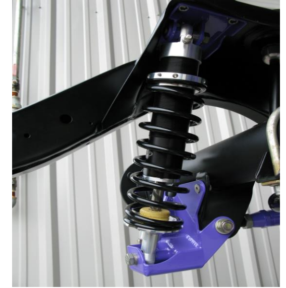
Figure 3 - Completed Installation

31. The installation is now complete. A finished installation can be seen in Figure 3 below. If the upgrade was purchased for the Single Adjustable, Double Adjustable Shocks or the Double Adjustable Shocks w/Remote Canisters, refer to the appropriate sections below for adjustability.