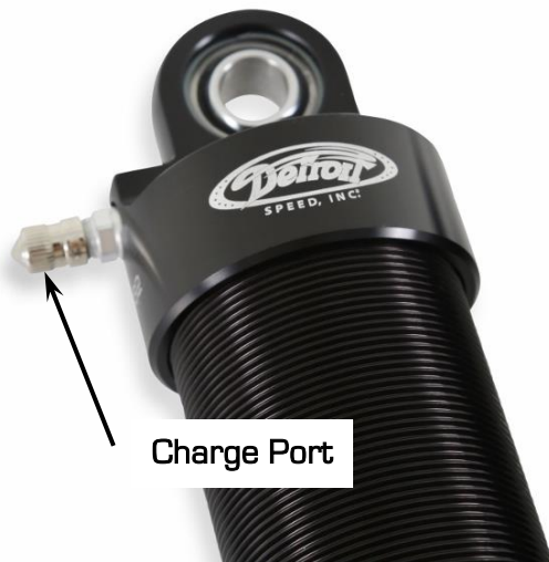
Figure 2 - Charge Port

The Mini-Tub Shocks are shipped with the correct nitrogen charge and will not need additional charging. If you need to recharge the shock pressure, the appropriate charge is 150 psi with nitrogen. Refer to Figure 2 for the charge port location. NOTE: To adjust the shock pressure you must use a proper shock inflation tool as seen in Figure 3. Detroit Speed offers this shock inflation tool available as P/N: O31063DS.