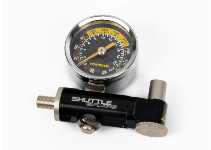
Figure 3 - Shock Inflation Tool

If you have any questions before or during the installation of this product, please contact Detroit Speed at sales@detroitsspeed.com or 704.662.3272