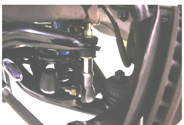
Figure 2 - End Link Installed

7. Center the sway bar in the car and the bushing clamps can now be tightened to the adapter plates. Torque the nuts to 25 ft/lbs.