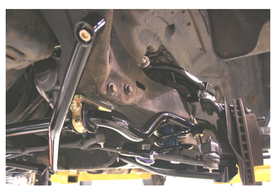
Figure 4 - Completed Installation

9. Reinstall the front wheels and torque to the manufacturer's recommended torque specs. Lower the vehicle to the ground. The finished installation should resemble Figure 4.