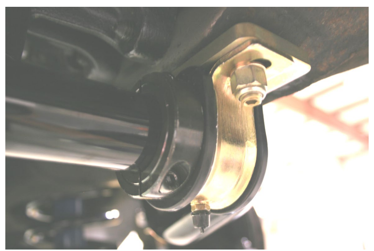
Figure 3 - Split Collar Clamp Installed

8. Separate the Split Lock Collar into two pieces and place around the sway bar to the inside of the anti-roll bar clamps. Reassemble the collar using High Strength Loctite on the bolts and torque to 15 ft-lbs. NOTE: Position the collars tight to the urethane bushing when installing. Figure 3 below shows the collar installed.