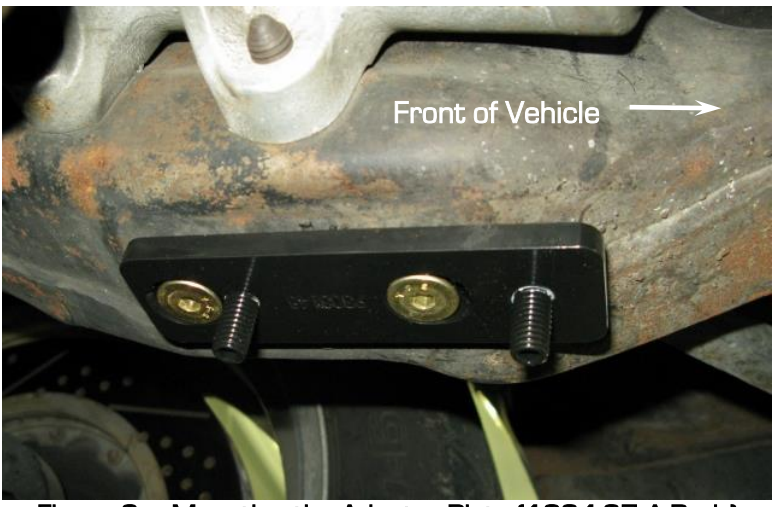
Figure 2 – Mounting the Adapter Plate (1964-67 A-Body)