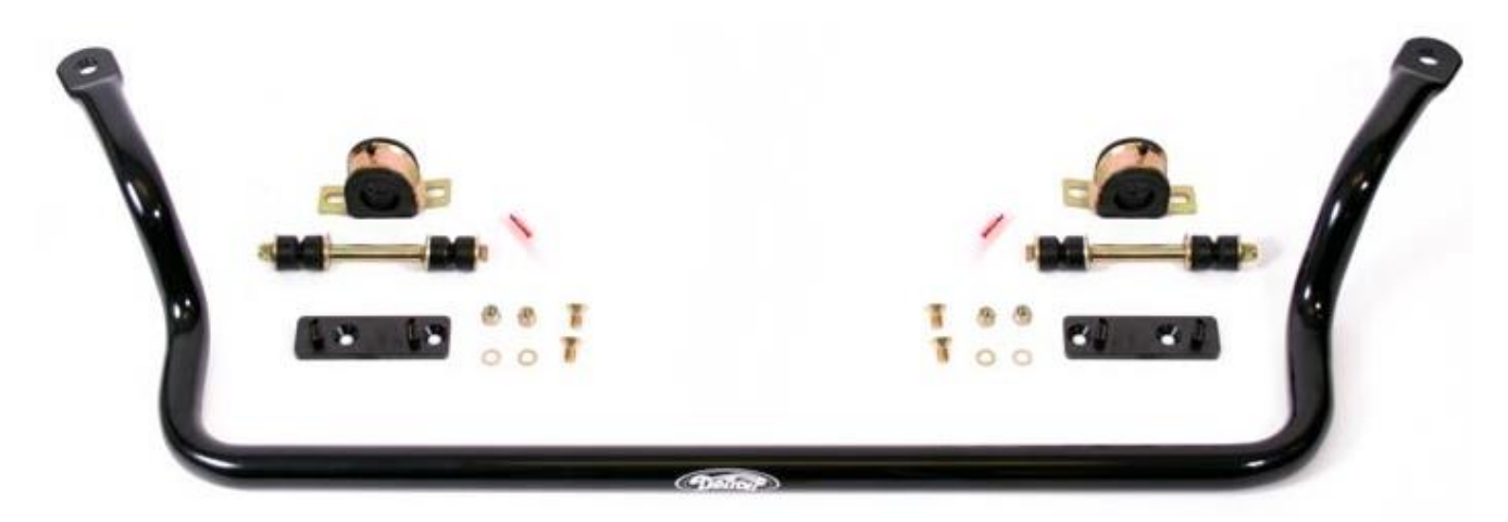
Figure 1 – Part Number 031402 Shown

The Detroit Speed, Inc. Front Tubular Anti-Roll Bar is designed to address the shortcomings of the small factory F-Body and A-Body Anti-Roll bar. The DSE Anti-Roll bar kit comes with greaseable polyurethane bushings, mounts and end links. Testing revealed a dramatic improvement on cars with stock suspension and optimal improvement on cars fitted with other DSE components.