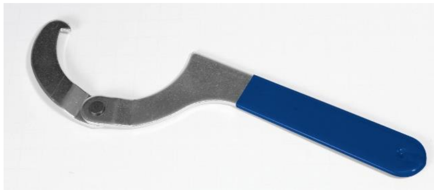
Figure 2 – Detroit Speed Spanner Tool