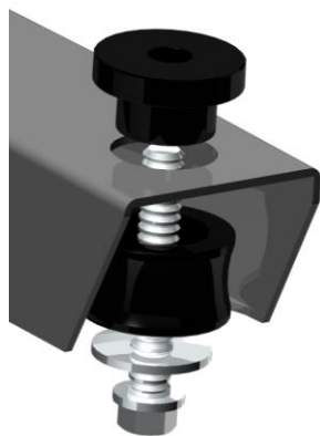
Assembly View of Body Mount to Frame